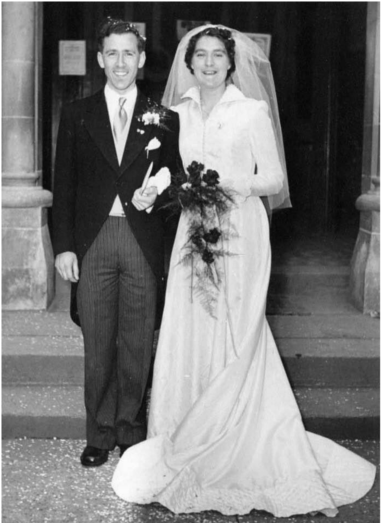
11 July 1953, Rathfarnham